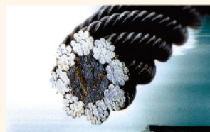
传统钢丝绳 Traditional wire rope